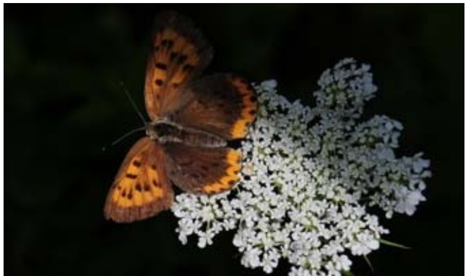
Bronze Copper on Wild Carrot

We moved to the parking area and then to gun club entrance in search of more dragonflies and butterflies in a different habitat.