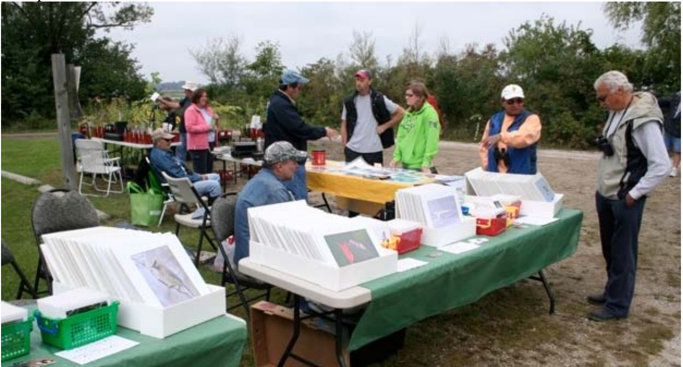
Vendors at Hawk Festival.