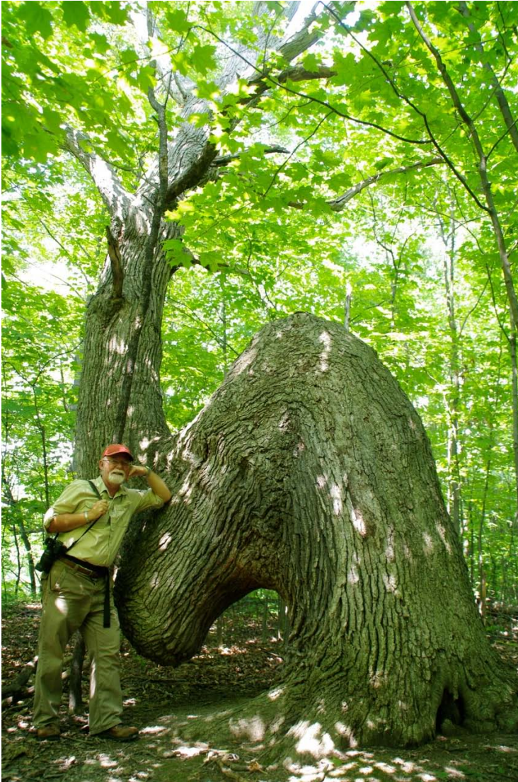
Gerry Waldron and White Oak at Kingsville Golf and Curling Club

There is something so beautiful, sophisticated, and poetic about trail marker trees. It is incredible to think in this age of frenzied, electronic communication, that living, natural messages so simple and practical are still standing on the landscape today – a centuries old tap on the shoulder pointing us the way home. Reaching back to a time before the car, before roads and traffic lights, when sticking to the forest trail was crucial to survival, and a wrong turn could spell danger or death. For these reasons, I would argue that our oldest trail marker trees are the most historically important trees in Ontario today.