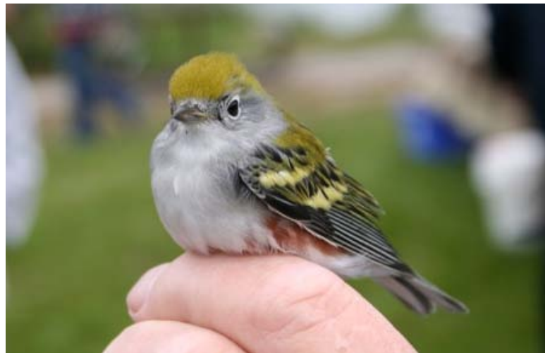
Chestnut-sided Warbler.