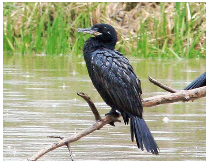
Adult Neotropic Cormorant at Muddy Creek on April 24-27, 2011