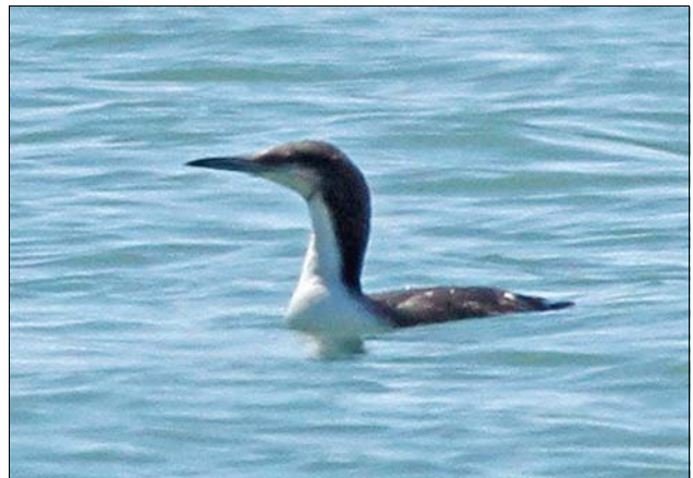
Immature Pacific Loon at Point Pelee on May 9-11, 2011