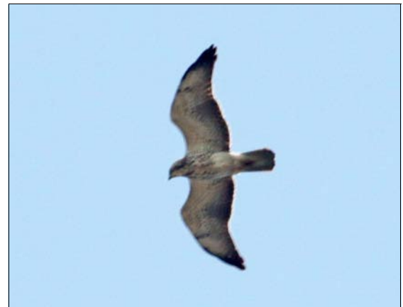
Juvenile Swainson's Hawk over the Visitor Centre on May 7, 2011