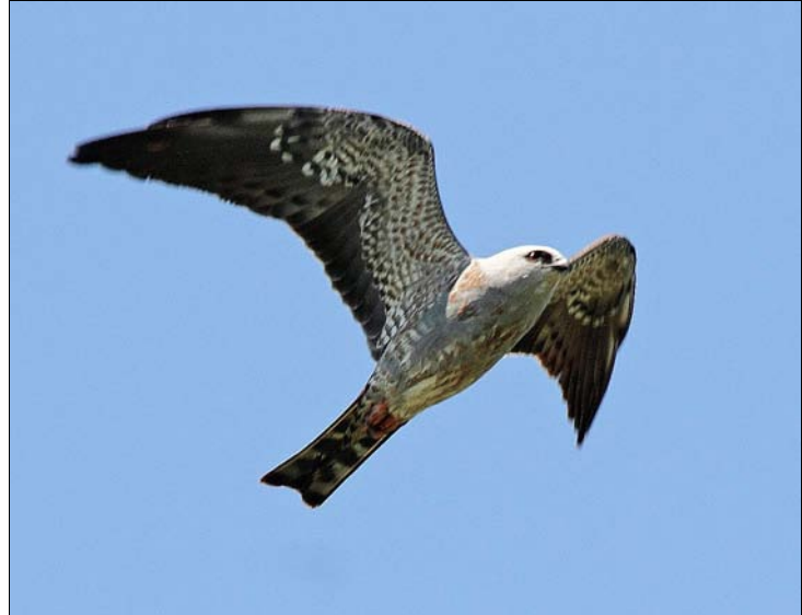
First-year immature Mississippi Kite at the west side of the Tip on May 24, 2011