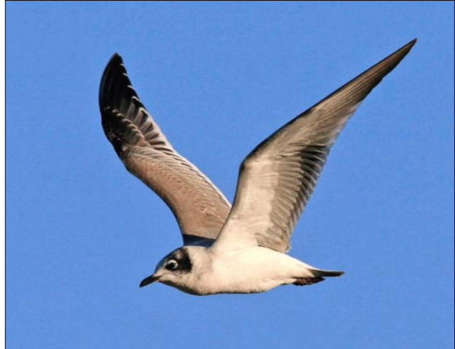
Immature Franklin's Gull at Sturgeon Creek on November 13–December 5, 2011 — Alan Wormington.

November 13–December 5 — one first-winter immature, Sturgeon Creek Marina (STP et al. )