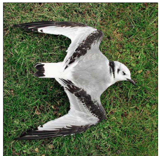
Immature Black-legged Kittiwake that was at Sturgeon Creek on December 27-29, 2011 — Alan Wormington.