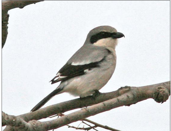
Loggerhead Shrike at the Tip on April 11, 2011 — Alan Wormington.

October 7 — one, flying south over DeLaurier Fields @ 12:50 p.m. (AW, MBR) – this is only the third modern-day record of Common Raven for Point Pelee; the others were present on October 23, 1965 and October 4-11, 1970.