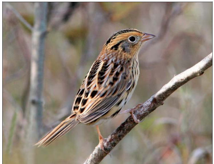
Le Conte’s Sparrow at the Sparrow Field on October 22-23, 2011