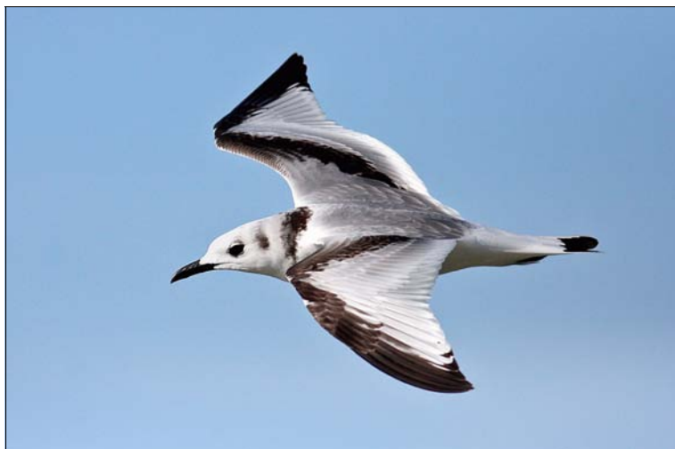
Immature Black-legged Kittiwake at the Tip on November 6, 2011 — Cherise A. Charron.

– unfortunately this bird died, and the specimen is now at the Royal Ontario Museum (Toronto).