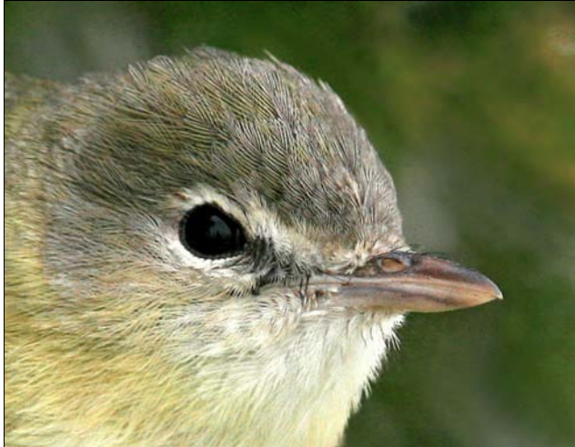
Bell's Vireo at the Tip on May 13, 2011