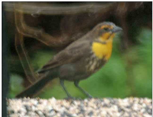
Female Yellow-headed Blackbird at SE Hillman Marsh on May 15, 2011