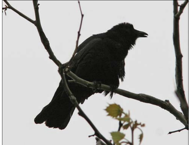
Fish Crow at the Visitor Centre on May 25, 2011 — Alan Wormington.